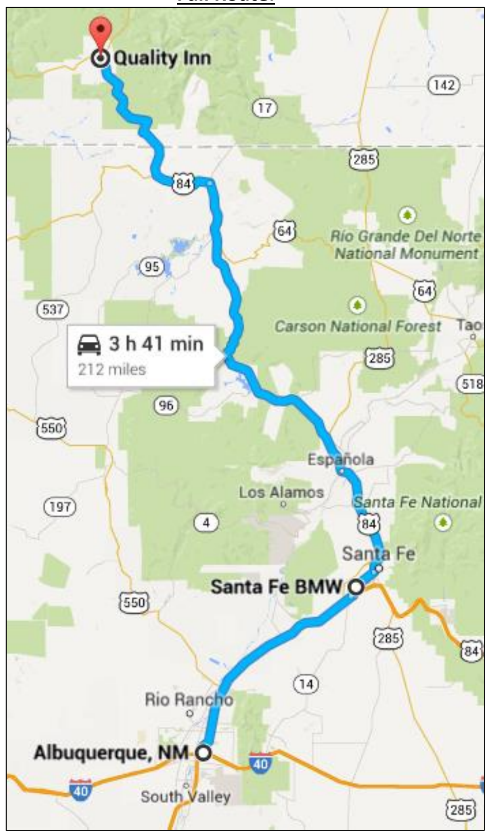
BMW 4 Corners Meet [Drive 4 Corners]. Pagosa Springs, Colorado.